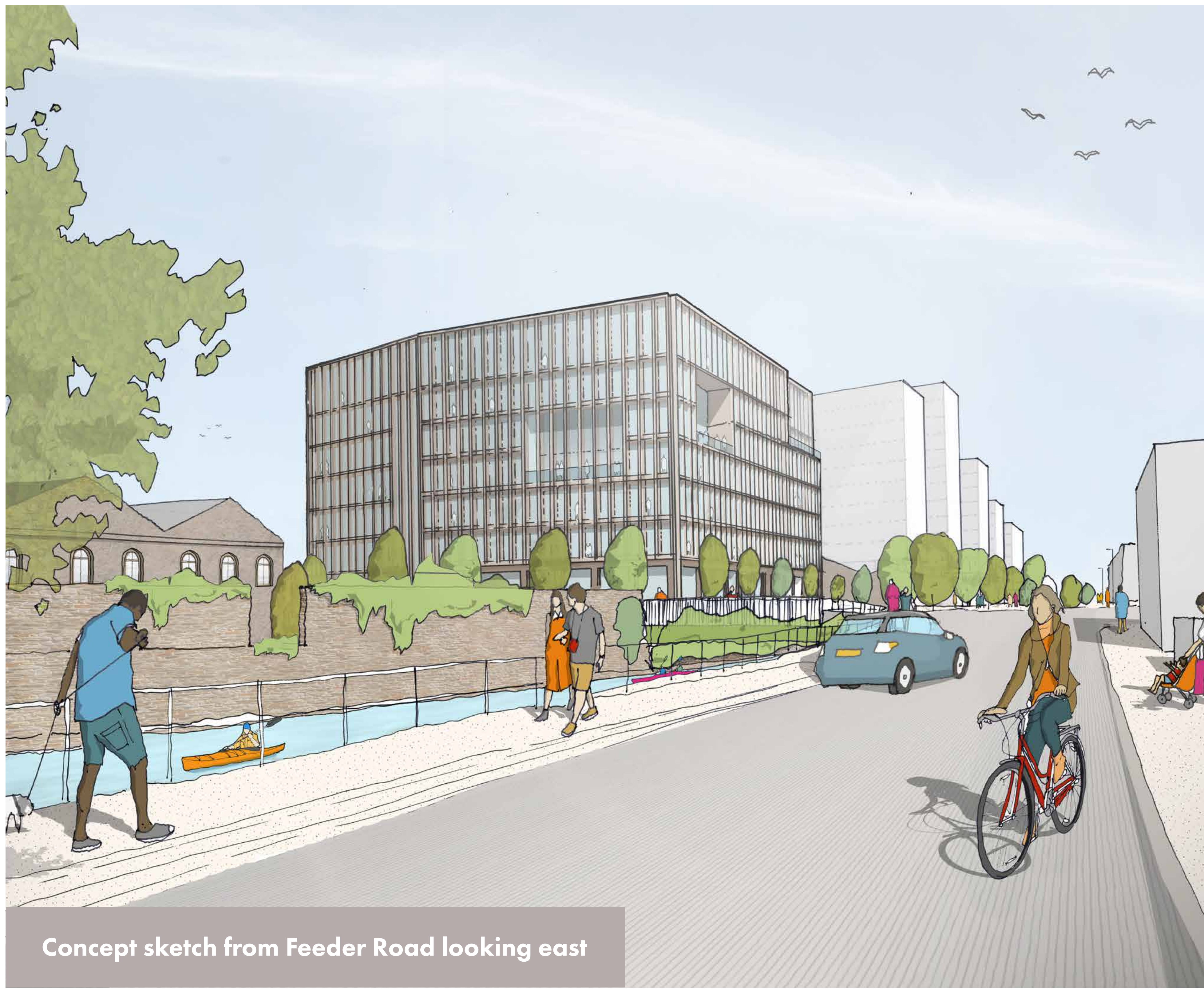
Concept sketch from Feeder Road looking east

The existing wildlife corridor along the Feeder Canal will be enhanced and expanded by a high quality landscape design.